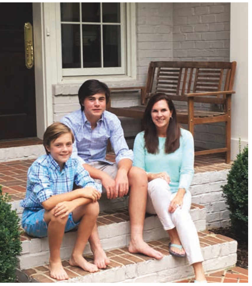
Settled into our (third) house in Myers Park - it's good to be "home."